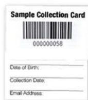
blood collection card