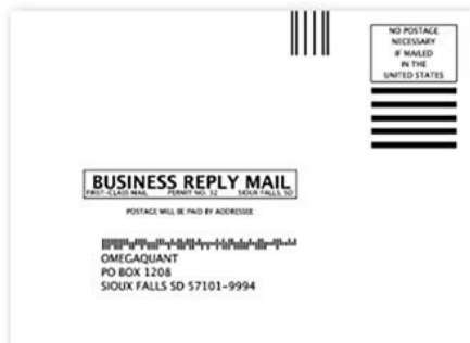
pre-paid return envelope